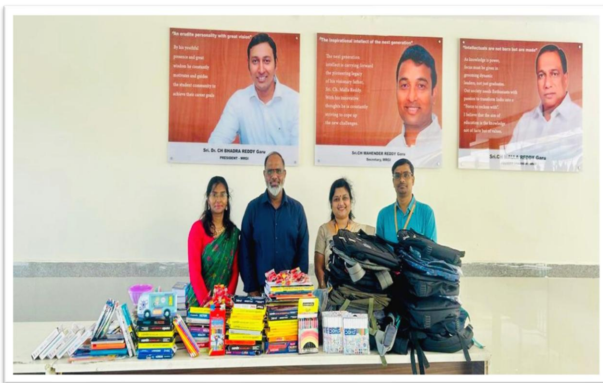
Principal, Head of H&S and faculty members with donated items