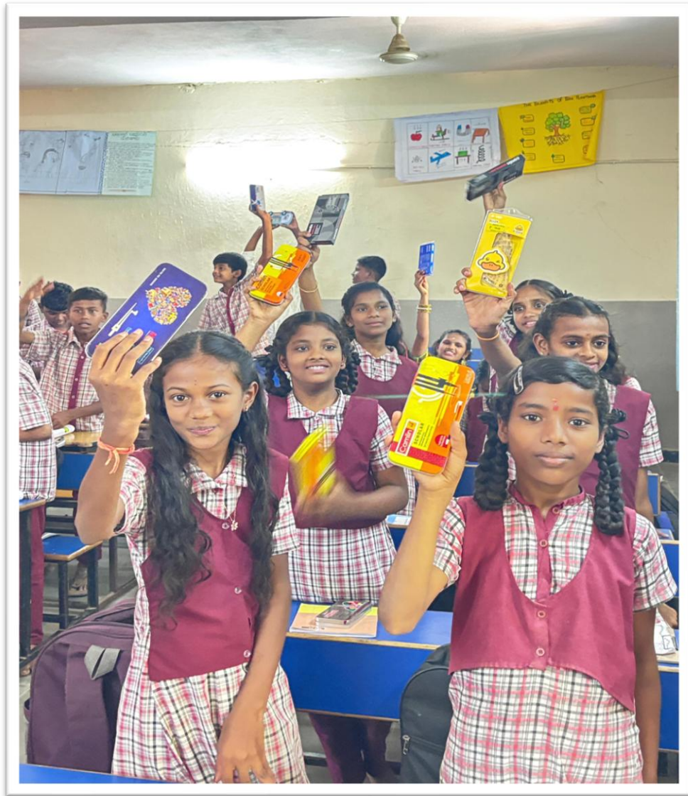
ZPHS students after receiving the kits

The International Literacy Day program organized by the Department of Humanities & Sciences was a meaningful step towards fostering the value of education and social responsibility. The event not only supported the learning needs of underprivileged children but also inspired college students to contribute positively to society. It truly reflected the spirit of the quotation – “One Student, One Teacher, One Book, One Pen – Changing the World Through Literacy.”